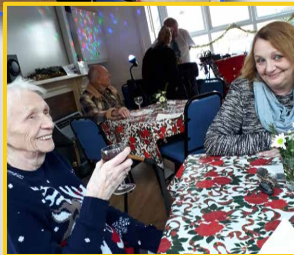
Members enjoying the Christmas afternoon.

The afternoon was a great success and members left with a Christmas gift.